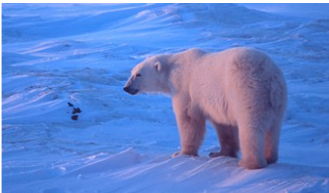
Polar bear ( Ursus maritimus ). Churchill, Manitoba, Canada.

The polar bear is a formidable predator and ranks at the top of the arctic food chain.