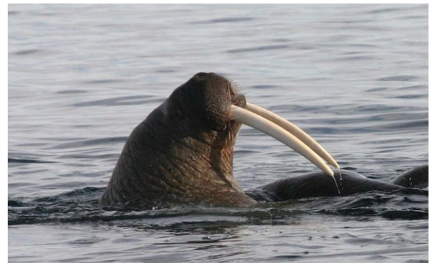
Polar bear prey: Walrus ( Odobenus rosmarus ).